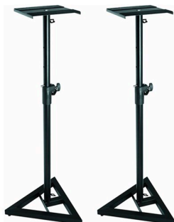
DL Studio Monitor Stands (Pair) https://www.storedj.com.au/dl-studio-monitor-stands-pair