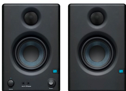
Presonus Eris E3.5 High Def 3.5" Studio Monitors (Pair) https://www.storedj.com.au/presonus-eris-e3-5-high-def-3-5-studio-monitors-pair

It doesn't matter what your budget is, there is something for everyone here! The best speakers are the ones you can afford but here is an example of some affordable monitors to get started on.